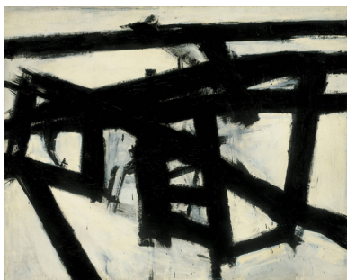
Franz Kline, Mahoning , 1956.

Abstract Expressionist artwork generally shows some motion or movement made by the artist in the act of making. Even artists who did not create their artwork by using big movements or gestures did, in many cases, achieve a sense of implied movement in the finished artwork by the marks made on the canvas. A sense of movement is also created by the all-over compositions that keep viewers' eyes moving around the artwork.