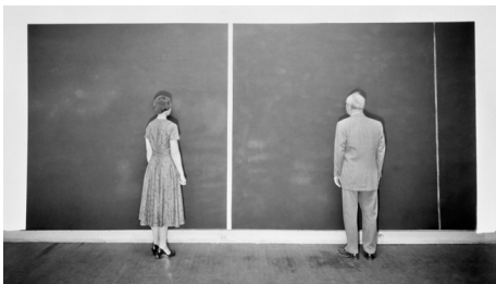
Barnett Newman, Cathedra , 1958.

Abstract Expressionist artwork does not generally contain realistic looking images of objects or figures. Instead, in Abstract Expressionist artwork, shapes, colors, and lines combine to create the “image.” Many Abstract Expressionists wanted people to be able to react to the artwork without the interference of associations with recognizable imagery.