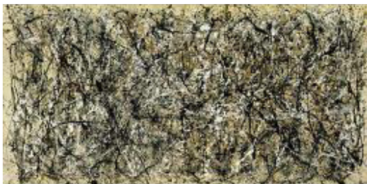
Jackson Pollock, Autumn Rhythm , 1950.

Many Abstract Expressionist artists wanted to immerse the viewer in a total experience of their art. Making art that was very large in scale helped Abstract Expressionist artists draw the viewer’s focus into the artwork to achieve this goal. Creating art that could be experienced , not just seen, was important.