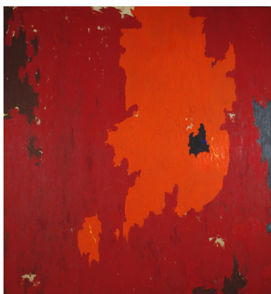
Clyfford Still, 1950-A-No. 1 (PH-272), 1950.

Abstract Expressionists used several different techniques to make their art. Some artists poured and dripped paint, moving around the canvas in the act of painting. Other artists applied broad, heavy, brush strokes with thick brushes, like artist Franz Kline (at left). Clyfford Still applied his paint with a trowel, in jagged swaths, sometimes layering it on very thickly, and in other places very thinly. Each artist's particular technique, their particular manner and order of applying paint to the canvas determined what their artwork would look like.