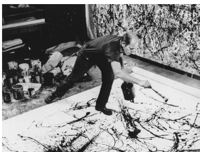
Jackson Pollock, 1950.